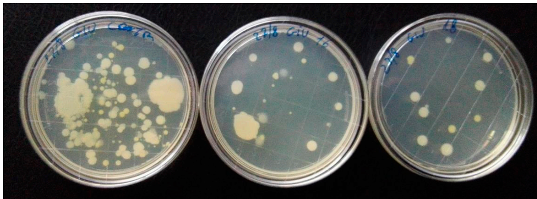
Figure 2. On the left, Petri dish showing baseline volunteer contamination after auscultation. The other two plates show the reduction of the contamination after one cycle (5 min) of UVC disinfection obtained by LED 16 (center plate) and LED 18 (plate on the right). Irradiation was performed after 1668 cycles of LEDs functioning.

After the incubation time, baseline volunteer contamination (control) was 104 CFUs while the result was 15 CFU after irradiation with LED 16, and 12 CFUs after irradiation with LED 18 (Figure 2). Both reductions were statistically significant ( p < 0.001 ).