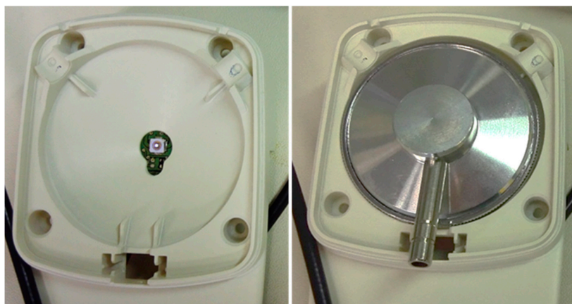
Figure 1. Experimental prototype developed for the execution of the experiments. On the right, the correct positioning of the stethoscope head during Ultraviolet C light (UVC) disinfection is shown.

An experimental design with pre-post treatment was conducted between August 2015 and March 2016 in the Laboratories of the Department of Molecular and Developmental Medicine, University of Siena. Using a 3D printer (Sketchup, Boulder, CO, USA) we created an experimental prototype for properly placing LEDs and the stethoscope head (Figure 1).